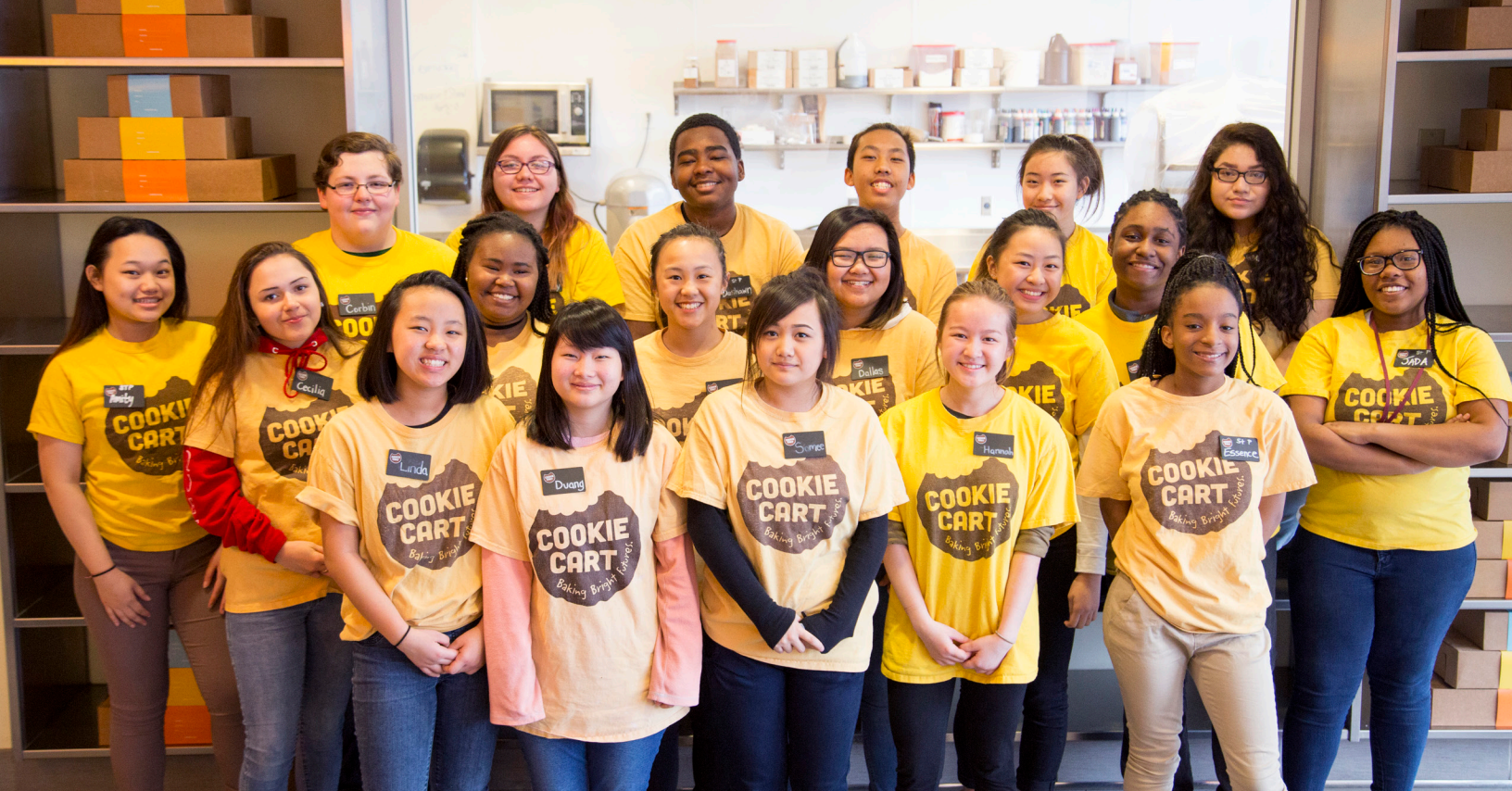
Youth employees from the Johnson High School pilot program visit Cookie Cart in Minneapolis.