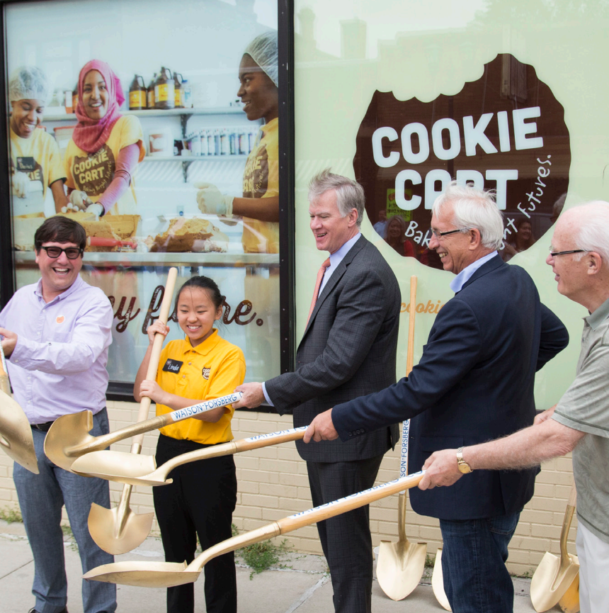
Groundbreaking Ceremony, June 2017